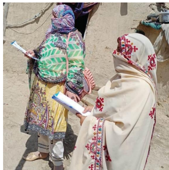
CBVs in Balochistan reaching people