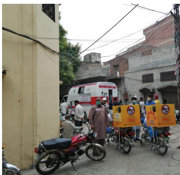
Micking by the frontline workers